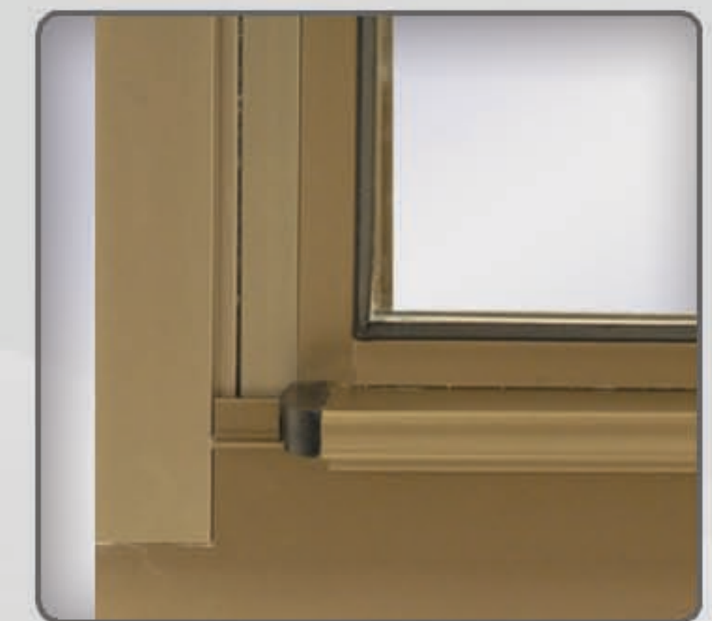
Continuous Lock Rail