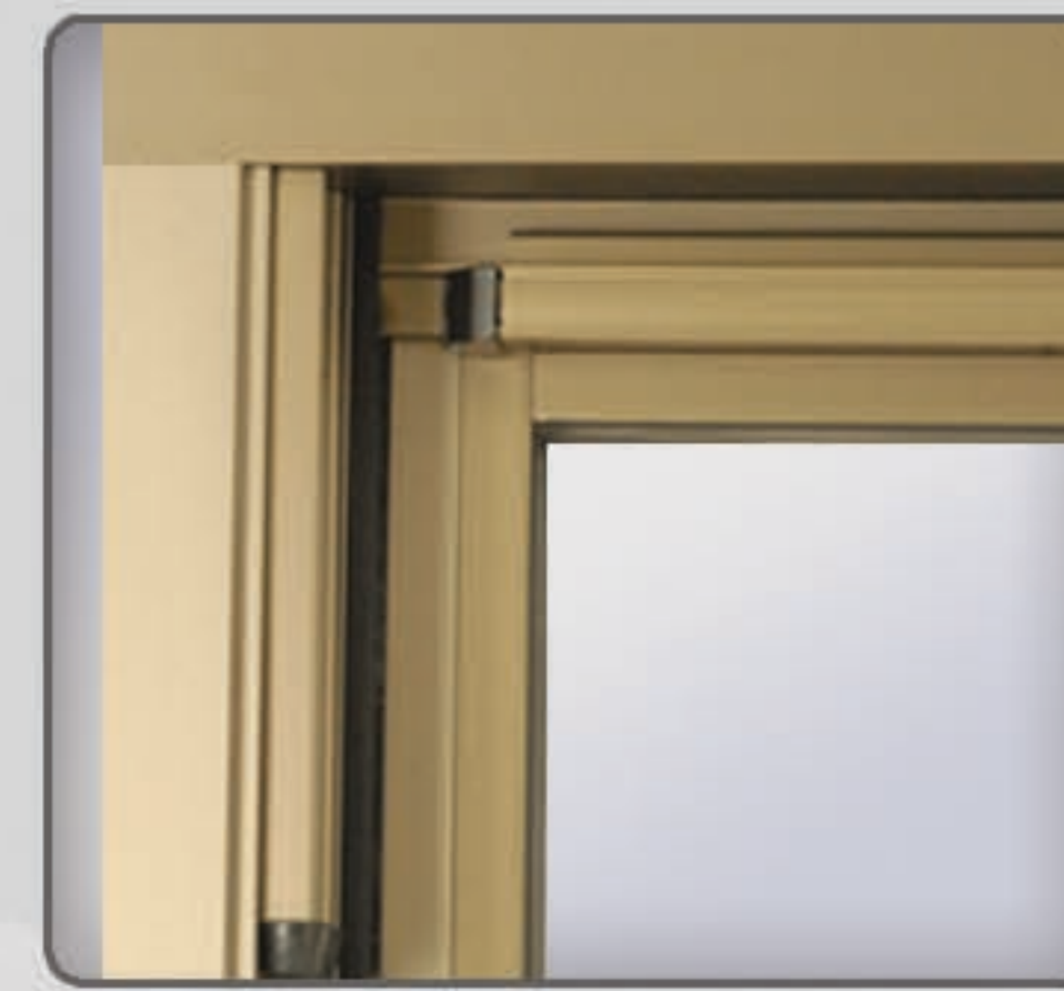
Metal Sash Stops