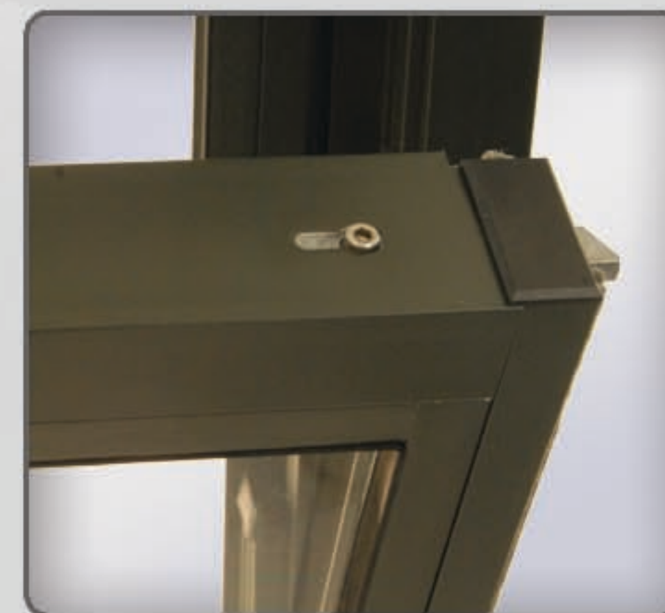
Concealed Tilt Latches